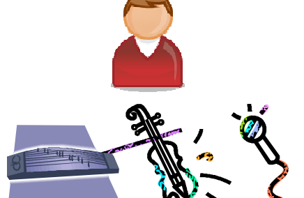
Violin + vocal + zither: